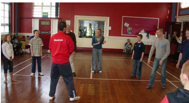
Playing Footie with the Liverpool Football Club Coaches

I would recommend going to anyone that wants to find out more, or just a day to enjoy. It’s made me want to get involved with the group even more, especially TeenTalk. I plan to take the husband to the next fun day in Birmingham so he can see what I am getting involved in and why. Look forward to meeting some more of you there!